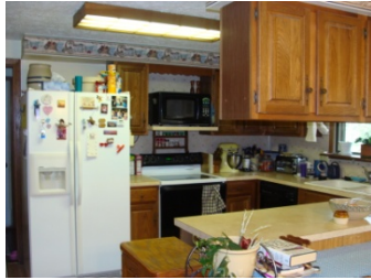
Kitchen-9'3 5 / 8 "x13'2 1 / 2 "