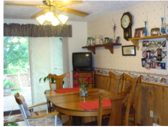
Dining Rm-11'2 7 / 8 "x13'3"